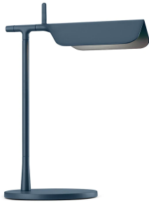
Table and floor lamps providing direct lighting with adjustable head. Body in painted pressofused aluminium. Multi-led diffuser in specially designed PMMA to avoid the Multi Shadow effect and dazzle. Head rotation from \pm 90^\circ .