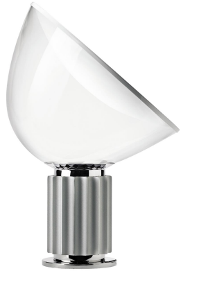
Table lamp providing indirect and reflected light. Reflector in painted aluminium, gloss white on the outside and matt white on the inside. Directionable diffuser in transparent PMMA. Body in matt black or naturally anodized extruded aluminium. Base in nickel-plated metal. Electric cable of useful length 220 cm, with dimmer switch for ON/OFF and adjustment of the light flow between 10-100%. Plug-in power supply with interchangeable plugs.

by Achille & Pier Giacomo Castiglioni , 1962